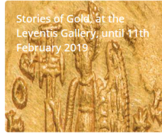
Stories of Gold, at the Leyentis Gallery, until 11th February 2019