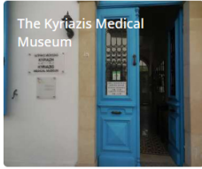
The Kyriazis Medical Museum