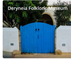
Deryneia Folkloric Museum