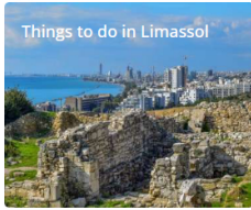
Things to do in Limassol