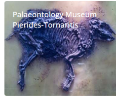
Palaeontology Museum Pierides-Tornaritis